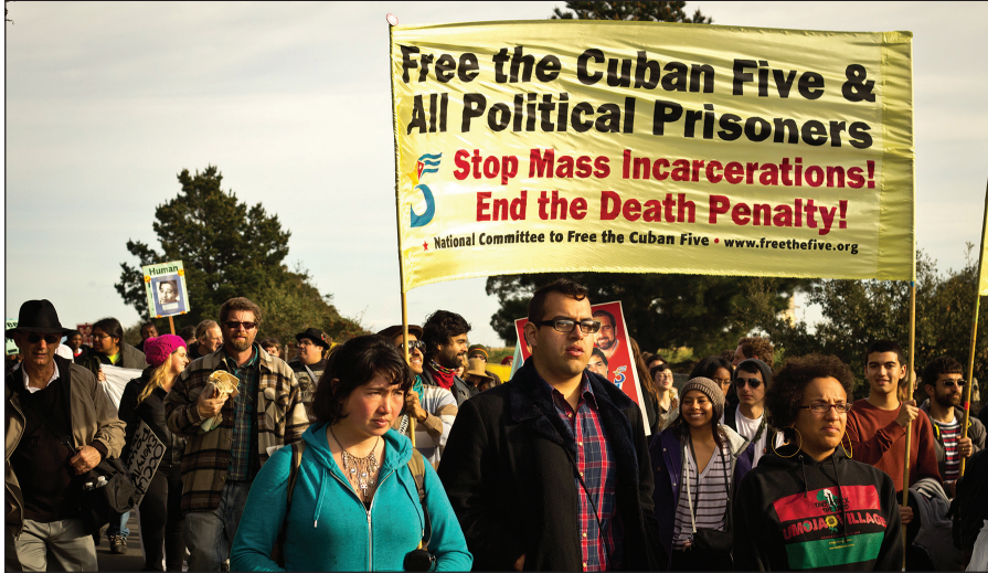
Occupy protest for Political Prisoners and Prisoners' rights, San Quentin

In addition to our organizing efforts, we have provided consistent personal support for our brothers in prison. Since 2001, we have supplied them with a daily subscription to the New York Times, and have sent them vital reading material and other material support. The NY Times has been very important, because they enjoy receiving in-depth news and being filled in on national and international developments, something which is so hard to come by in a U.S. prison. We have encouraged hundreds of their followers to send them letters, birthday and holiday greetings.